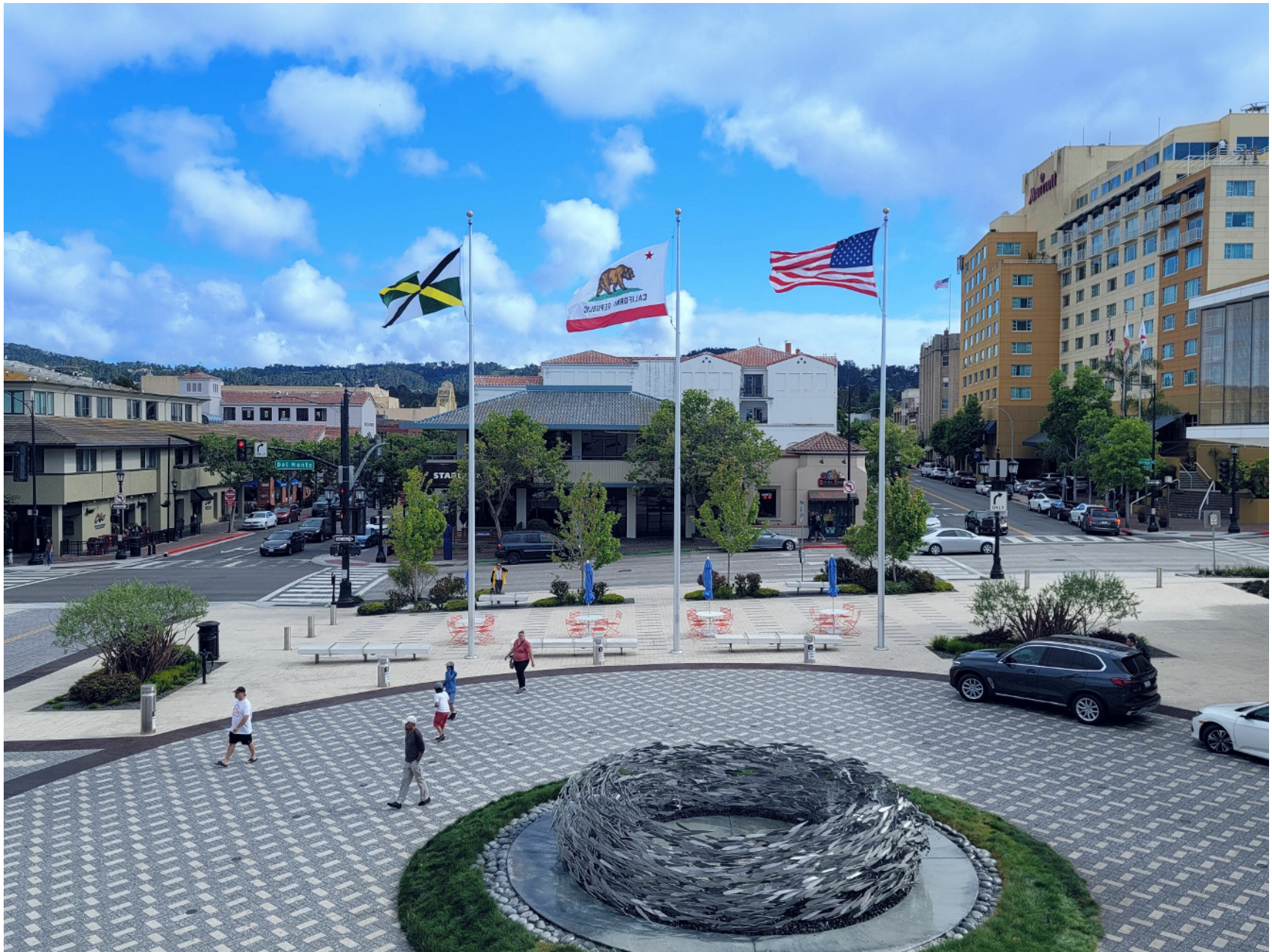
Monterey Conference Center Front Entrance Circle Driveway One Portola Plaza